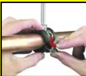
Push the screw