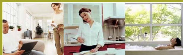
Private flats, houses and apartment blocks