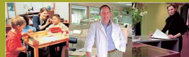
Commercial / public buildings